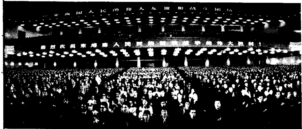
A view of the Peking rally.