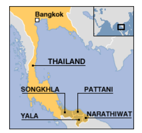
TROUBLED SOUTH: Home to most of Thailand's 4% Muslim minorityMuslim rebels fought the government up to the mid-80s Suspected militants have upped attacks this year, targeting BuddhistsSecurity forces' response criticised by rights groups

General Sirichai denied rumours that the death toll could be higher. But the rumours have stoked memories of a 1992 incident known as Black May, when pro-democracy students in Bangkok disappeared after an army crackdown. 'Revenge attacks'