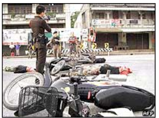
The attackers took part in an almost suicidal mission

Mystery surrounds the identity of the attackers - and the reason for what many see as little more than a suicide mission.