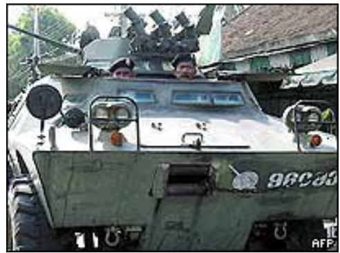
Security officers are now patrolling the troubled southern provinces