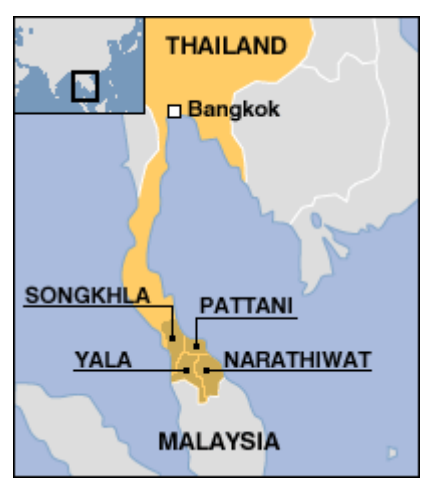
Yala: At least five police posts attacked Songkhla: Security base targeted Pattani: Shoot-out between police and gunmen trapped in mosque