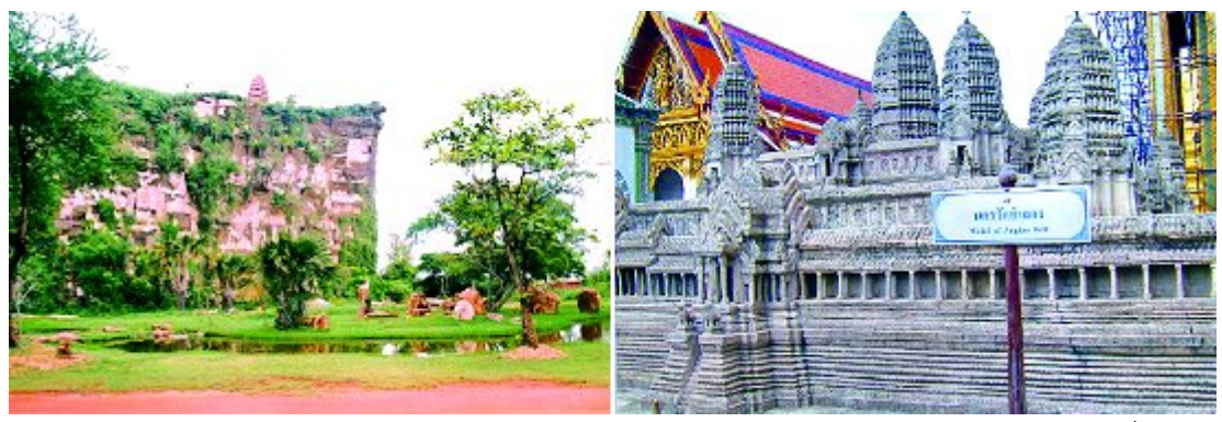
Duplicated version of Prasat Preah Vihear

On the left is Prasat Preah Vihear, which was built on a small hilltop in Samuth Prakan Province is about 30 km away from Bangkok, was illegally pirate-copied from Khmer Preah Vihear in Preah Vihear province. On the right is Angkor Wat is also illegally pirated-copied from Khmer, which was built in the Royal Palace in the middle of Bangkok. They built these two temples to teach and terribly mislead their children that Khmer stole them from them, perhaps. The present royal government of Cambodia hasn't lodged their complaint to Thai government yet: