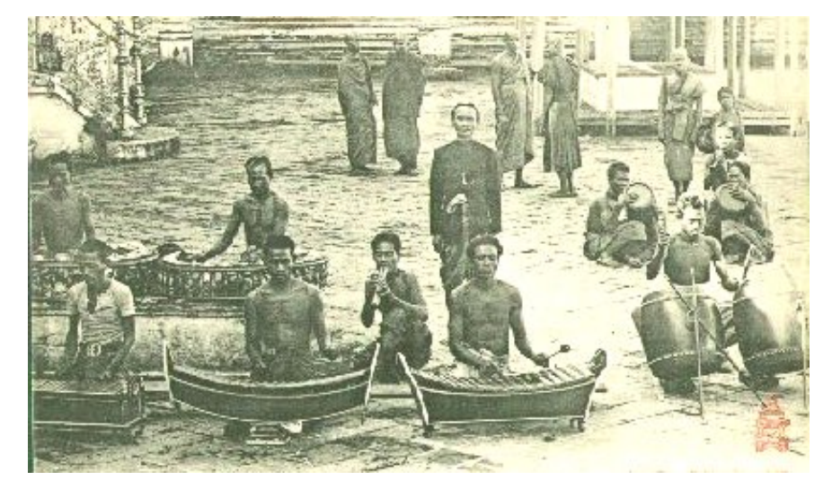
Cambodia L'orchestre "Pin Peat"

And today, there are too many of Khmers who still awfully misunderstand that "Phleng Siam" instead of "Pin Pet." Why do we Khmers still misunderstand like that? Because we Khmers have had too many foreign warmongers who secretly try to create too far many Killing fields so far so worse.