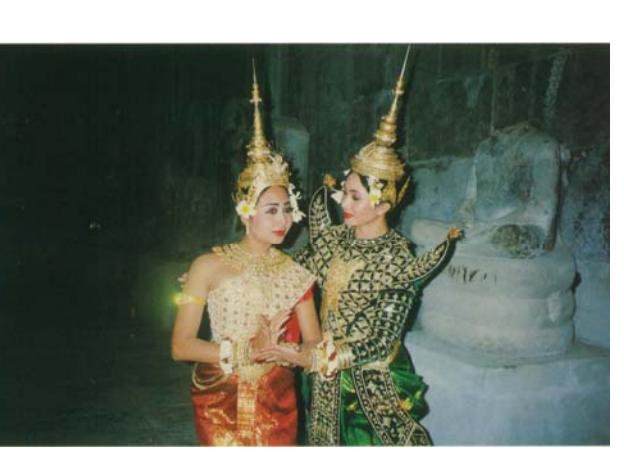
Apsaras Dancing at Angkor Wat *